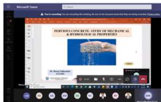
MS Teams Meeting Snapshots

Department of Civil Engineering & Department of Civil Engineering in Association with Indian Society for Technical Education (ISTE) organized a webinar on PERVIOUS CONCRETE – OVERVIEW OF MECHANICAL & HYDROLOGICAL PROPERTIES WITH GENERAL CIVIL ENGINEERING CASE STUDIES' for II, III and IV year UG students & PG students on 24 th MAY 2021 through MS Teams.